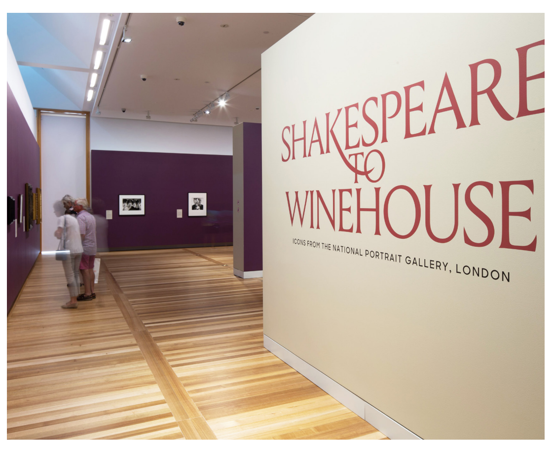
Visitors exploring Shakespeare to Winehouse: Icons from the National Portrait Gallery London.