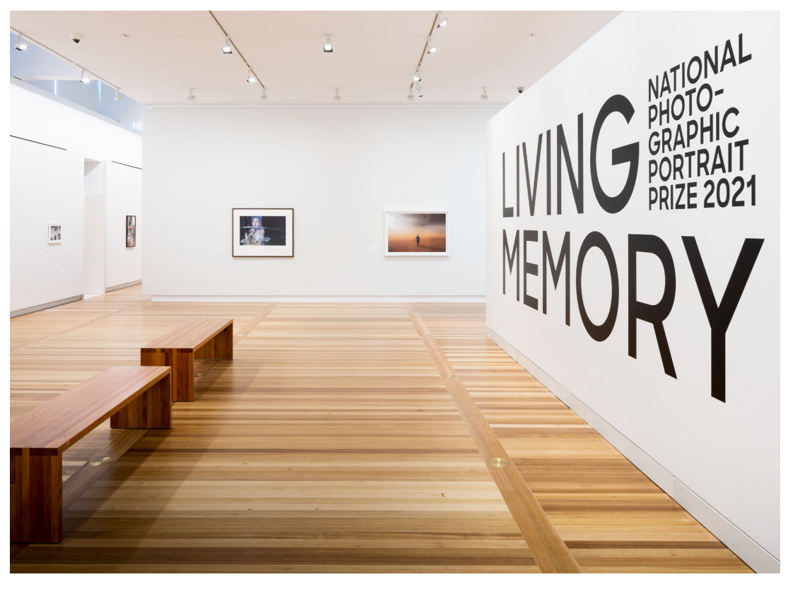
Living Memory: National Photgraphic Portrait Prize 2021.