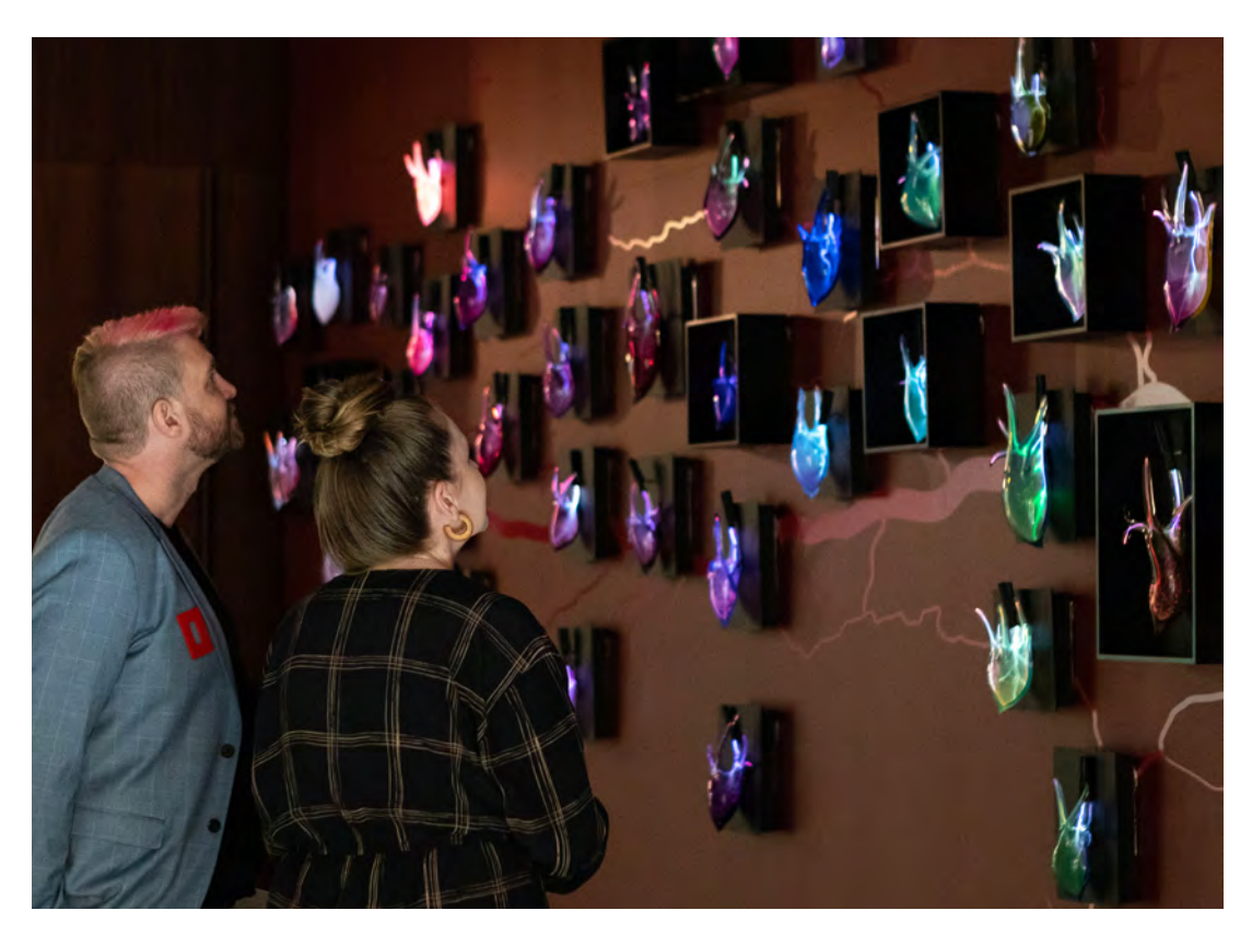
spaces\ between\ movement\ and\ stillness\ by\ Harriet\ Schwarzrock.