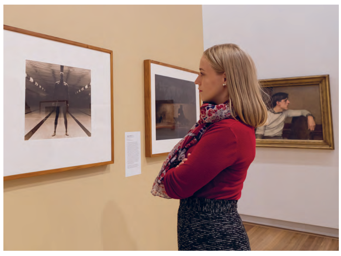
A visitor explores \it This \, is \, my \, place \, collection \, display.