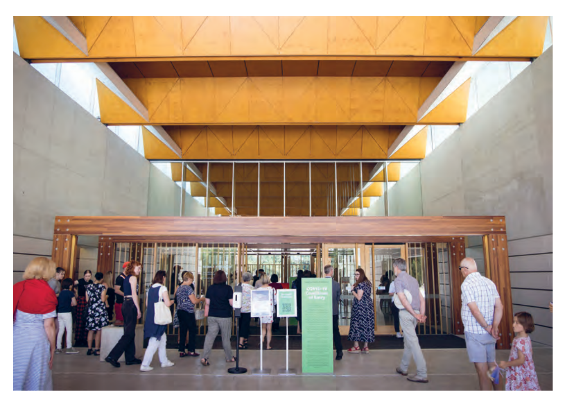
My Place dance performance by QL2 Dance in response to the collection exhibition display, This is my place .