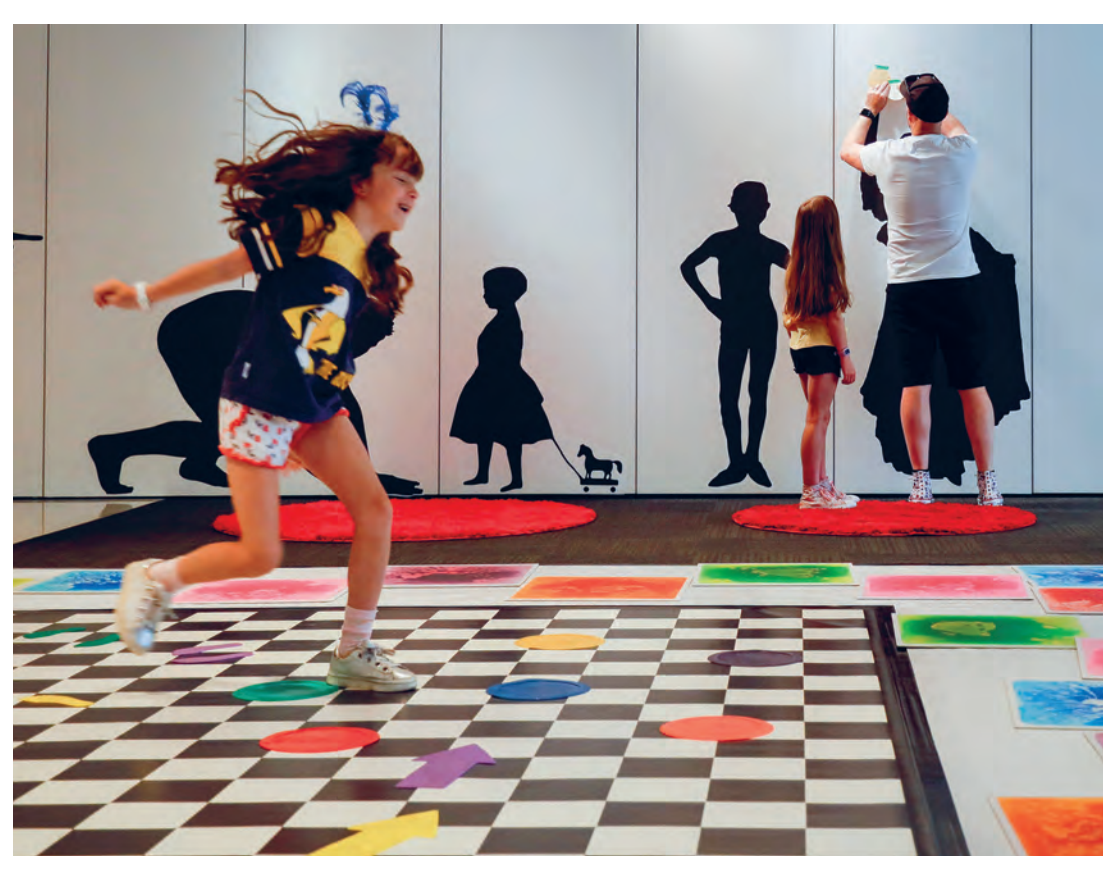
Family Space: Move it! Summer holiday space for visitors of all ages and abilities to explore pose, expression and movement.